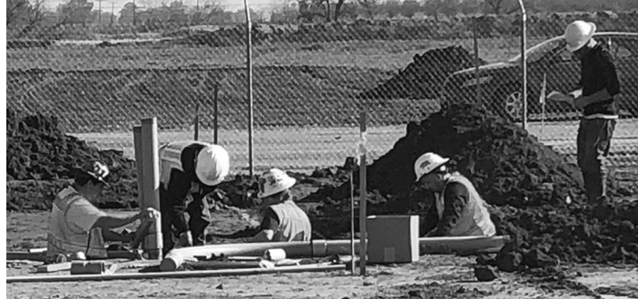
Work has begun to build a second 750,000 gallon water tank plus booster pumps on a site visible from Highway 99 north of the Berenda Slough.